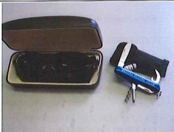
New Sunglasses and Multi Tool/Flashlight