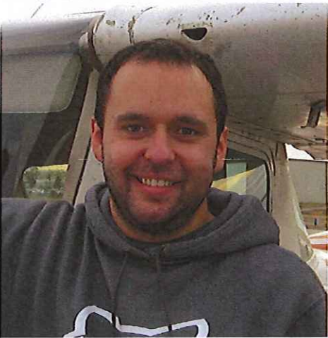
FIRST SOLO!!! Nov. 5, 2010