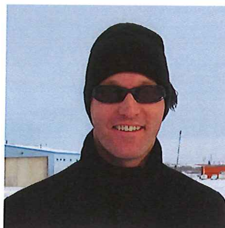
FIRST SOLO!!! Nov. 26, 2010