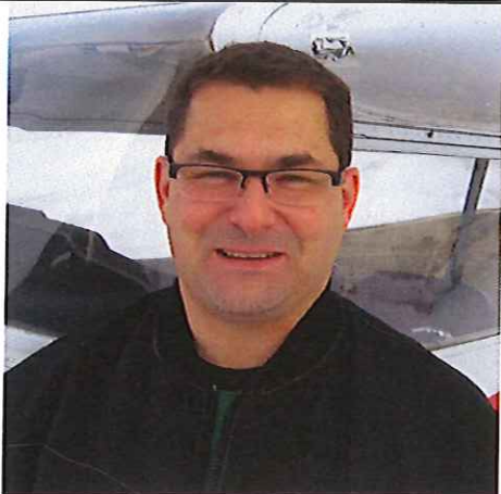
FIRST SOLO!!! Nov. 26, 2010