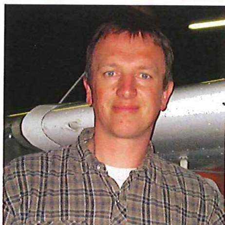
FIRST SOLO!!! Nov. 8, 2010