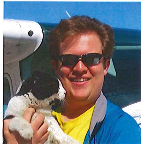
FIRST SOLO!!! April 10, 2012