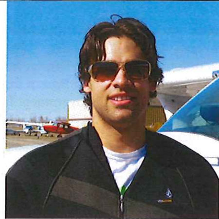
FIRST SOLO!!! April 3, 2012