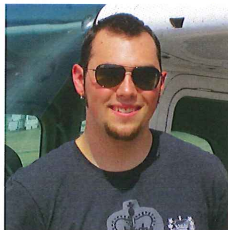
FIRST SOLO!!! May 15, 2012