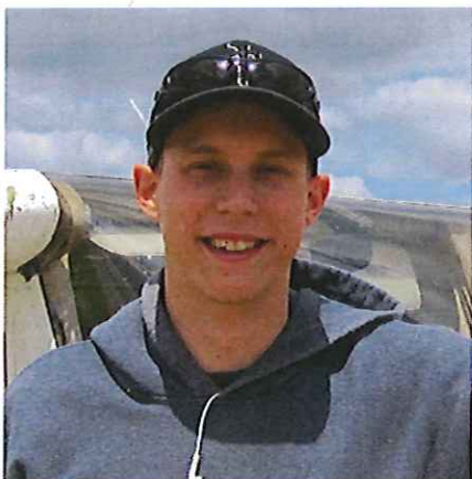
FIRST SOLO!!! June 9, 2011