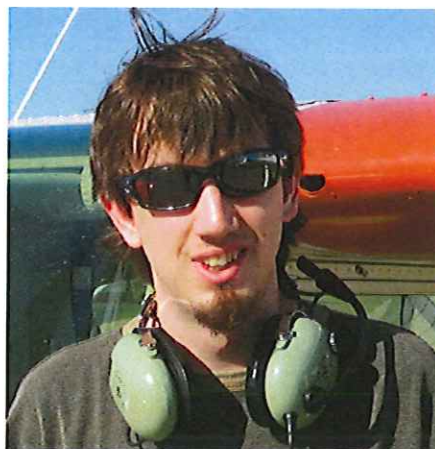
FIRST SOLO!!! June 29, 2011