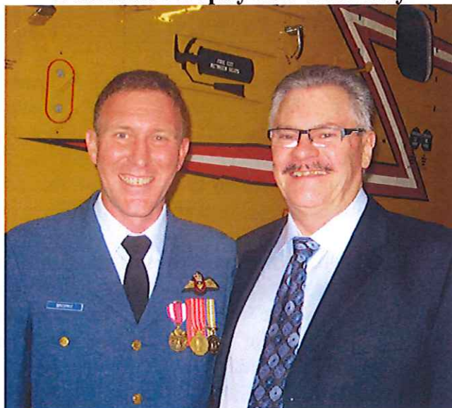
440 Squadron – Yellowknife, NT