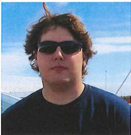
FIRST SOLO!!! June 29, 2011