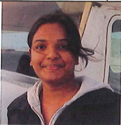
FIRST SOLO!!! Nov. 28, 2012