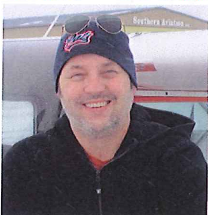
FIRST SOLO!!! Dec. 10, 2012