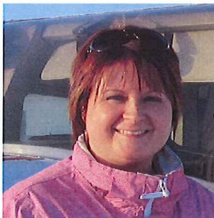
FIRST SOLO!!! March 27, 2013